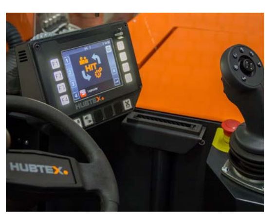
HUBTEX information terminal

The height and inclination of the steering column and the air-suspended seat offer the driver additional comfort.