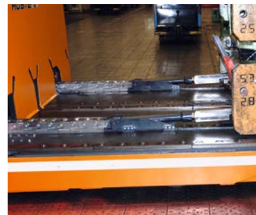
Extremely low table heights