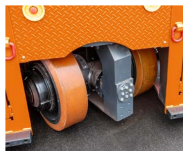
The vehicles have a large steering angle