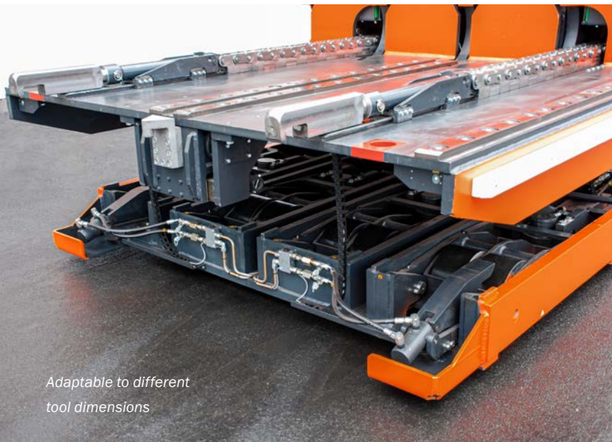
Adaptable to different tool dimensions