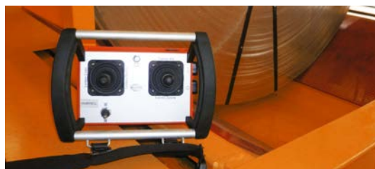
Choice of wired or radio remote control