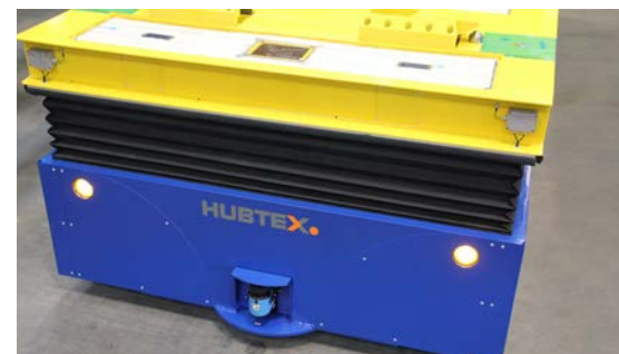
Integrated lifting device