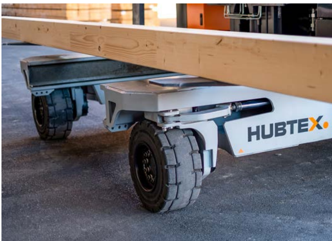
The parking brake is automatically activated when changing direction.