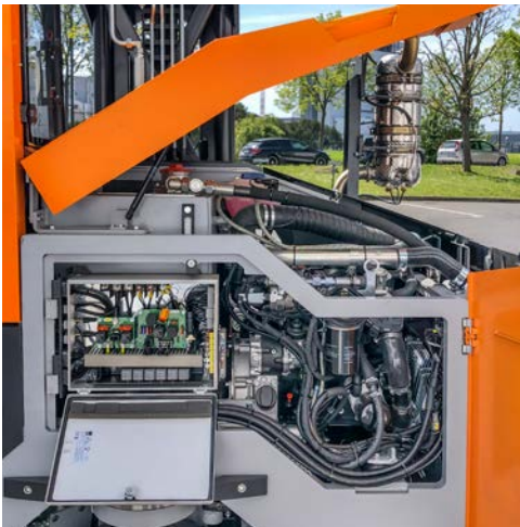
Reduced-noise turbo engine in line with the current emissions standard

Thanks to the combination of intelligent engine control, pumps and fans, the new truck is the first of its kind to offer an energy-saving Eco mode. This can reduce fuel consumption by 30 percent. As an added bonus, noise has been reduced to a minimum.