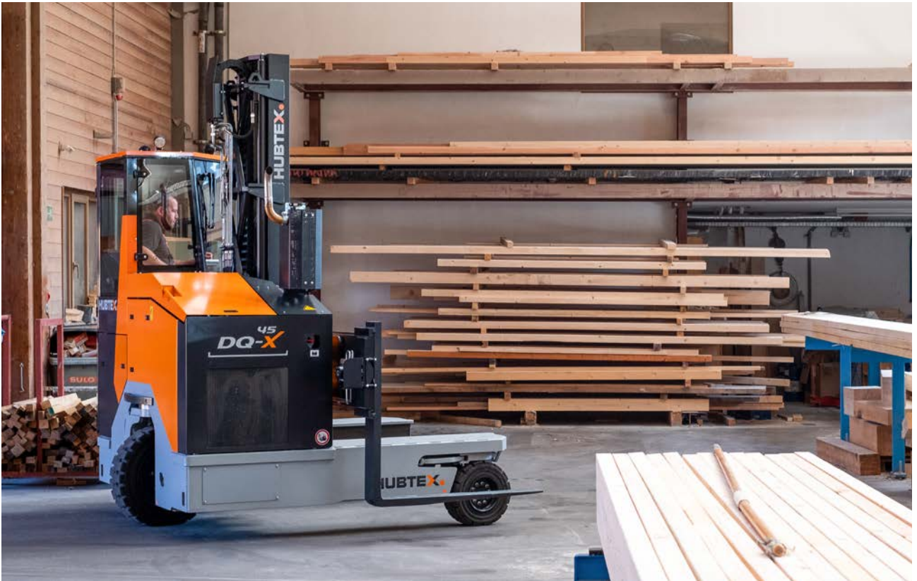
The innovative stabilisation assistant prevents unwanted rocking movements when braking hard.