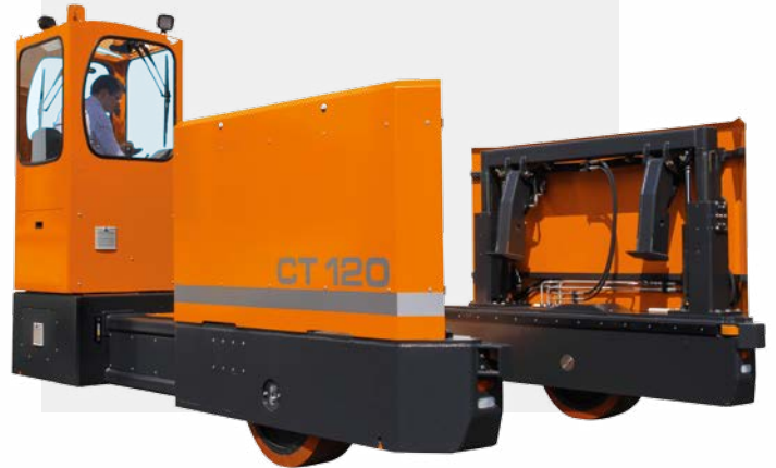
Lifting the load via swivel arms