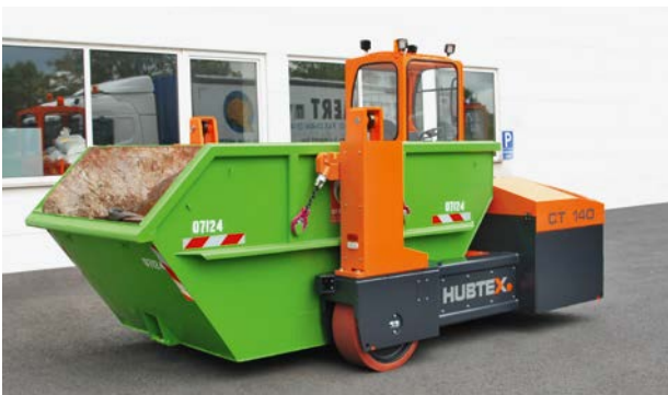
HUBTEX skip transporter straddle a conventional skip