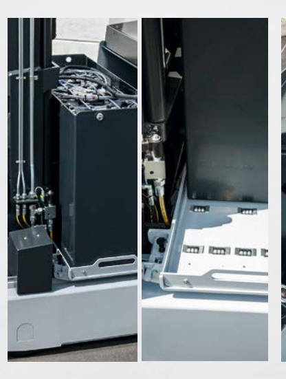
Easy battery exchange via roller conveyor