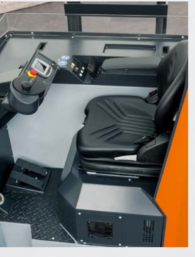
Clearly configured controls and easy operation via HUBTEX fingertip switches