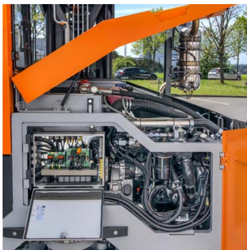
Reduced-noise turbo engine in line with the current emissions standard

Thanks to the combination of intelligent engine control, pumps and fans, the new truck is the first of its kind to offer an energy-saving Eco mode. This can reduce fuel consumption by 30 percent. As an added bonus, noise has been reduced to a minimum.