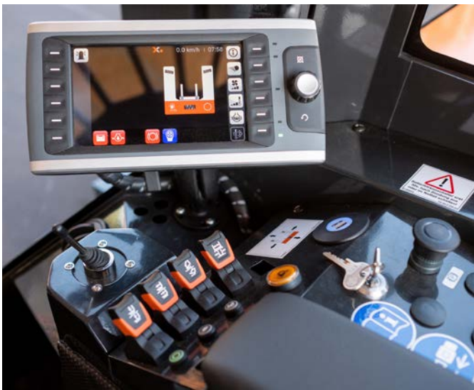
Depending on the application, you can switch between the three driving modes Eco, Sensitive and Speed. This can reduce exhaust emissions and fuel consumption.