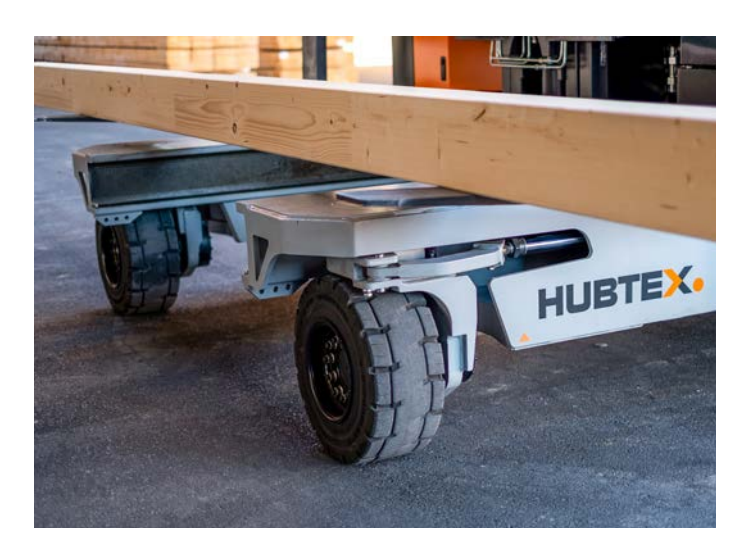
The parking brake is automatically activated when changing direction.