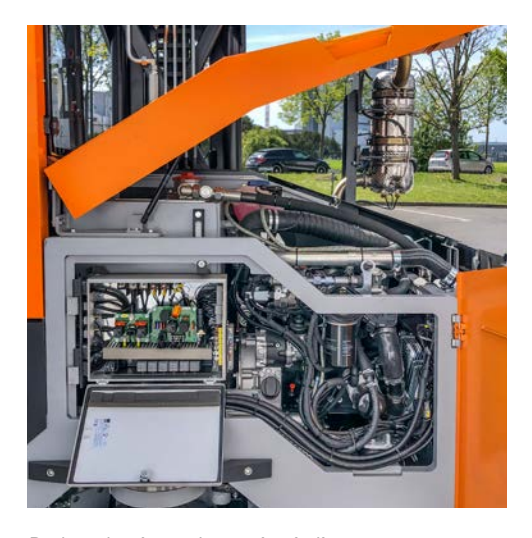
Reduced-noise turbo engine in line with the current emissions standard

Thanks to the combination of intelligent engine control, pumps and fans, the new truck is the first of its kind to offer an energy-saving Eco mode. This can reduce fuel consumption by 30 percent. As an added bonus, noise has been reduced to a minimum.